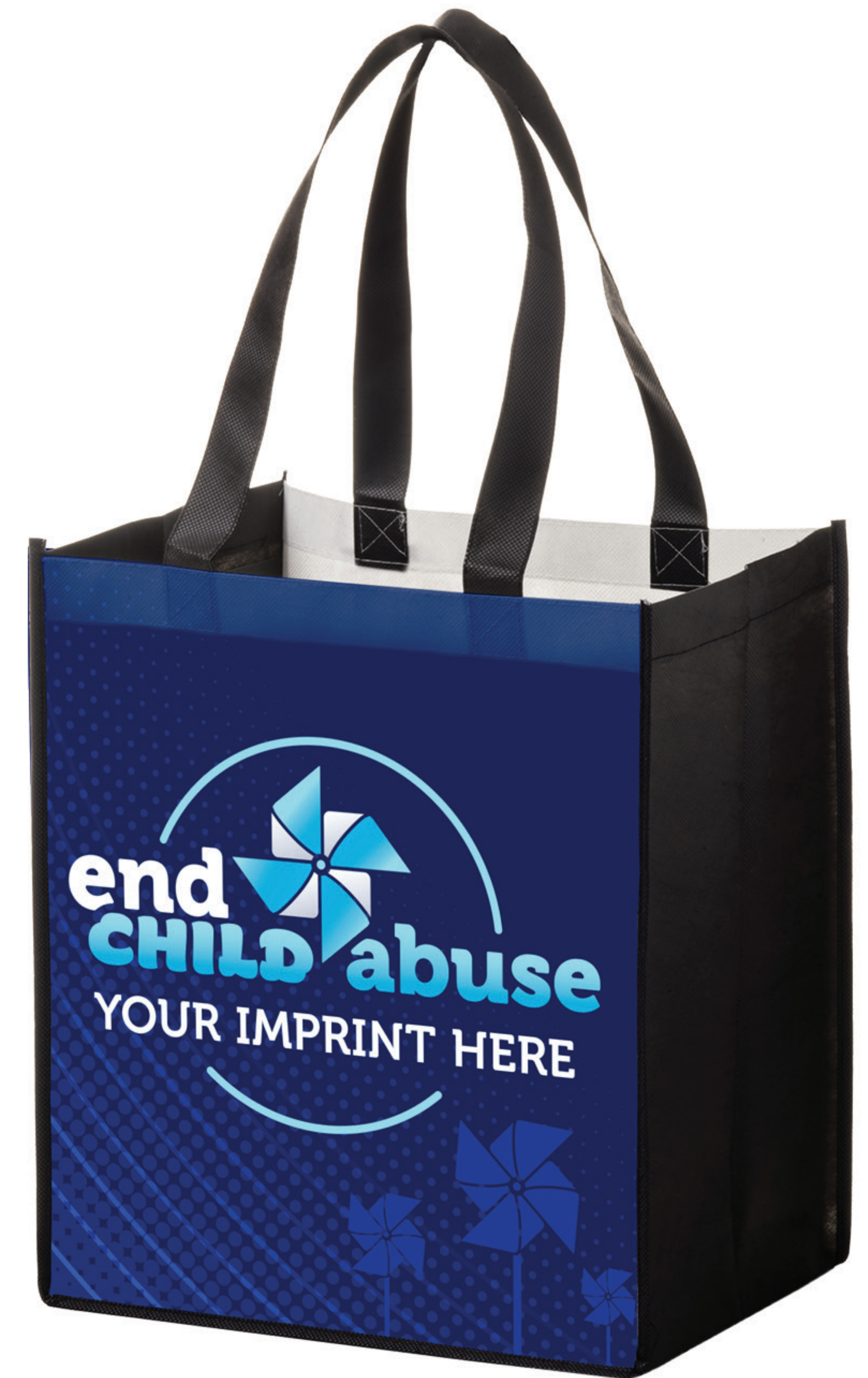
3350 - PROGRAM GROCERY TOTE TEMPLATE: CA-04