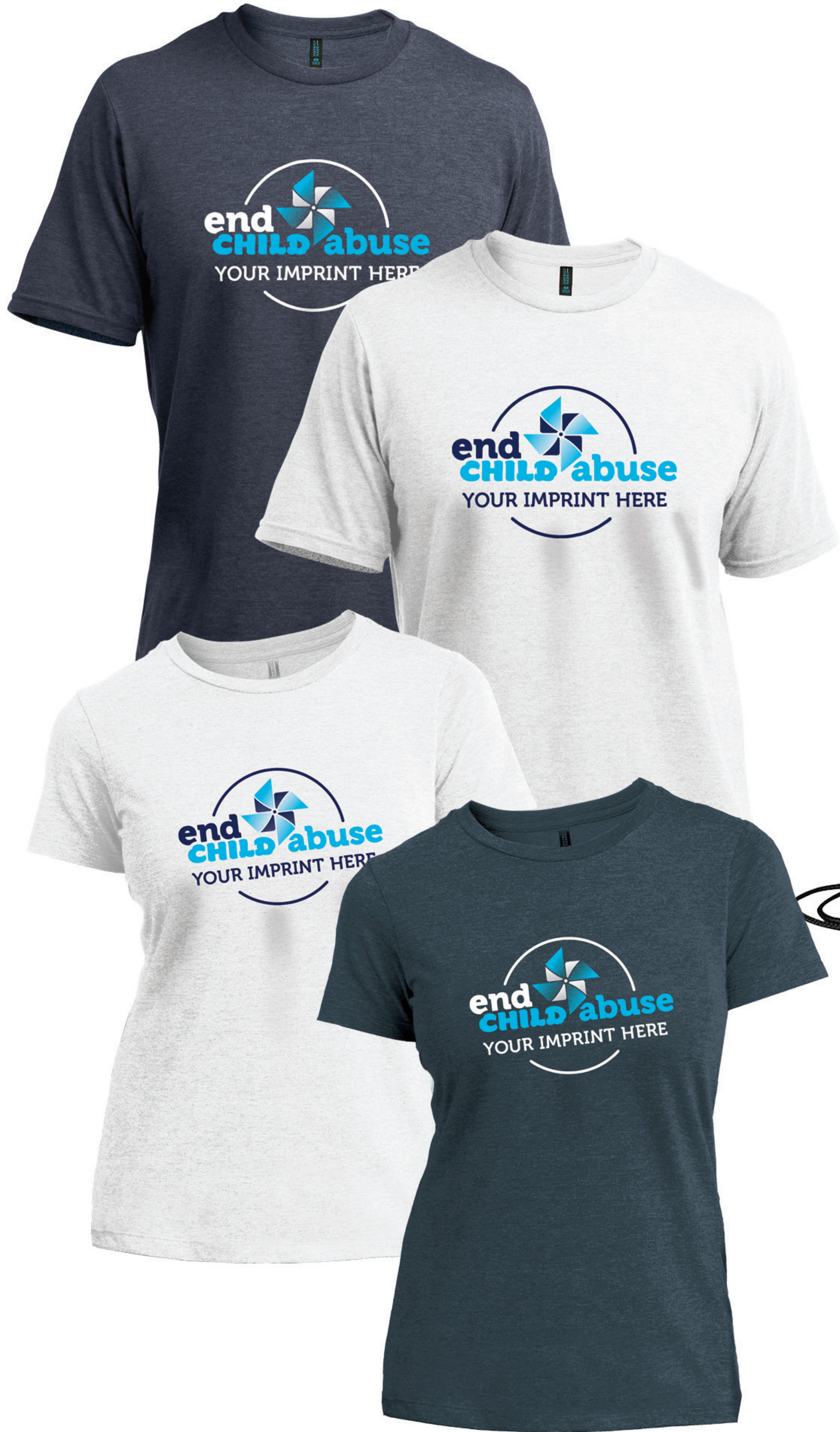
2673/2674 - AWARENESS T-SHIRT TEMPLATE: CA-03 Shown on Heathered Turquoise and White