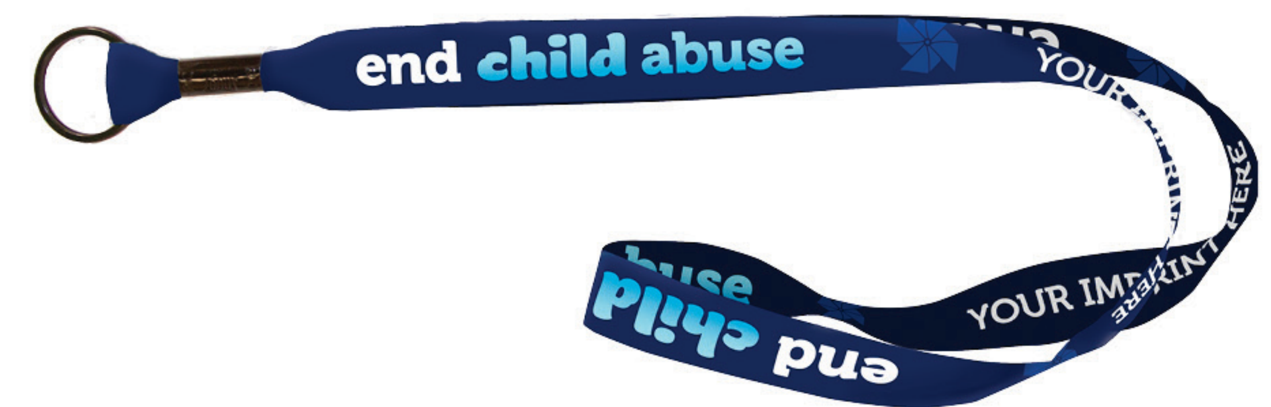
3024 - AWARENESS LANYARD TEMPLATE: CA-03