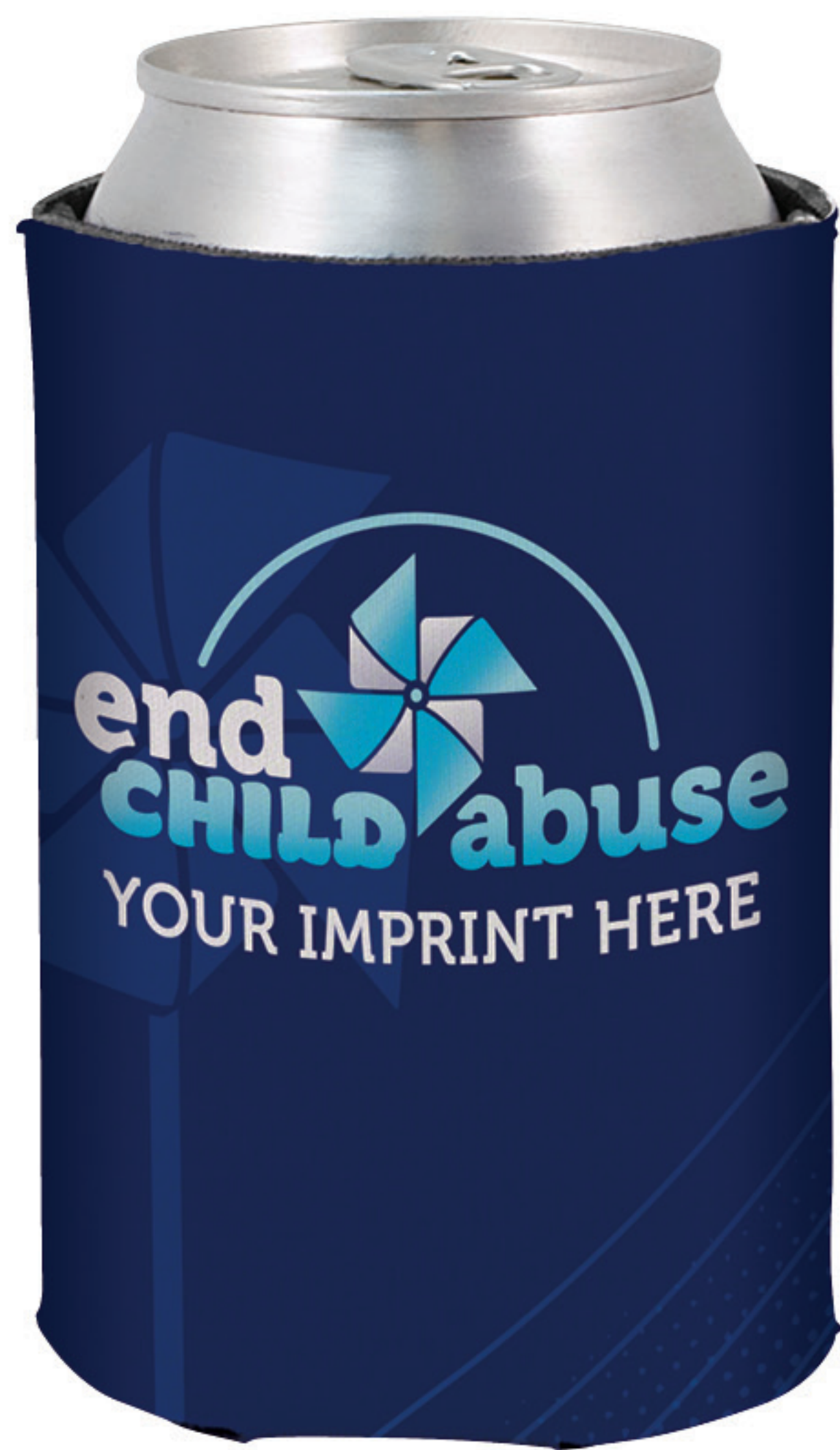
3096 - BE RESPONSIBLE CAN INSULATOR TEMPLATE: CA-02