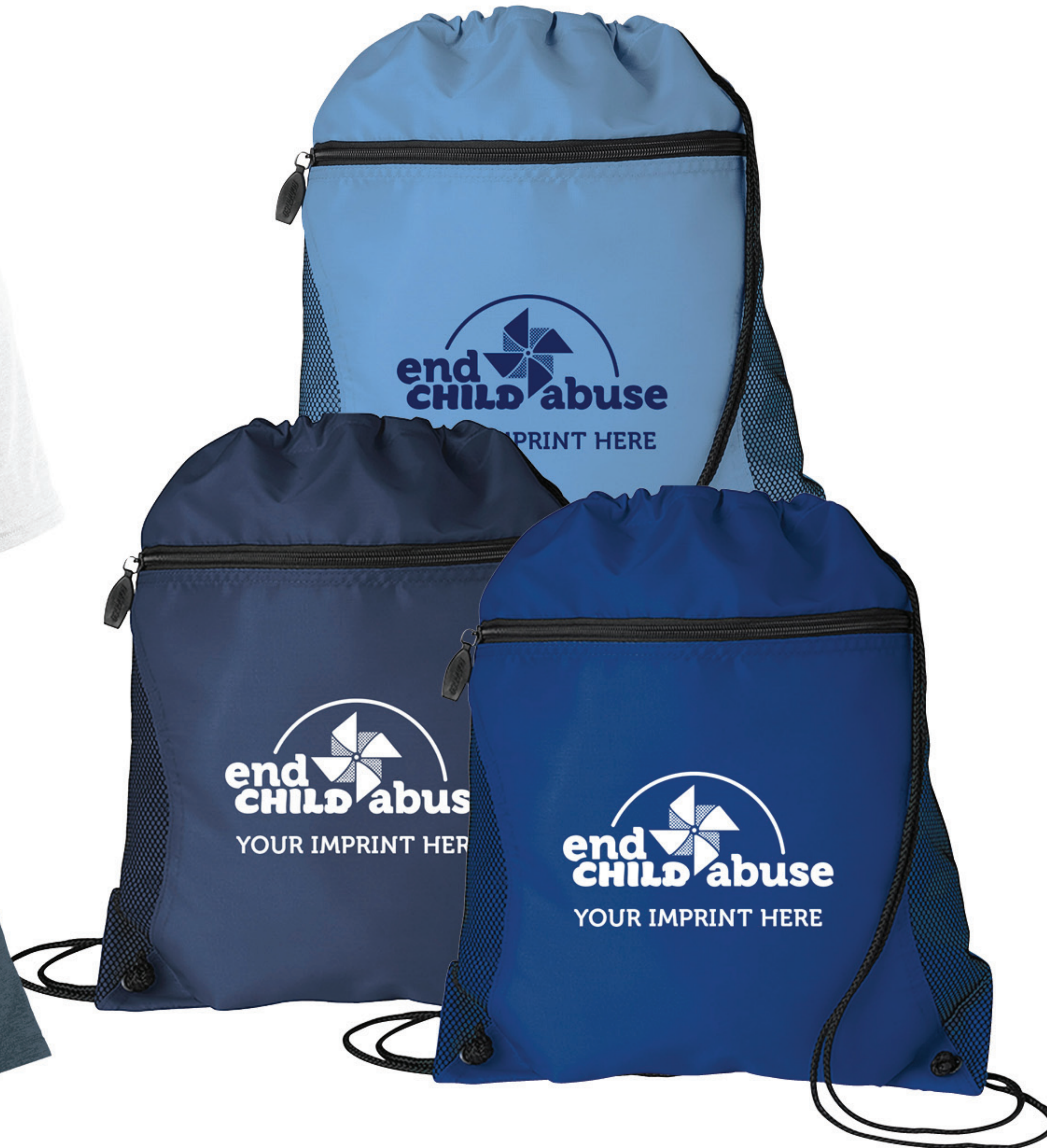
2746 - AWARENESS CINCHPACK TEMPLATE: CA-03 Shown on Light Blue, Blue, & Navy