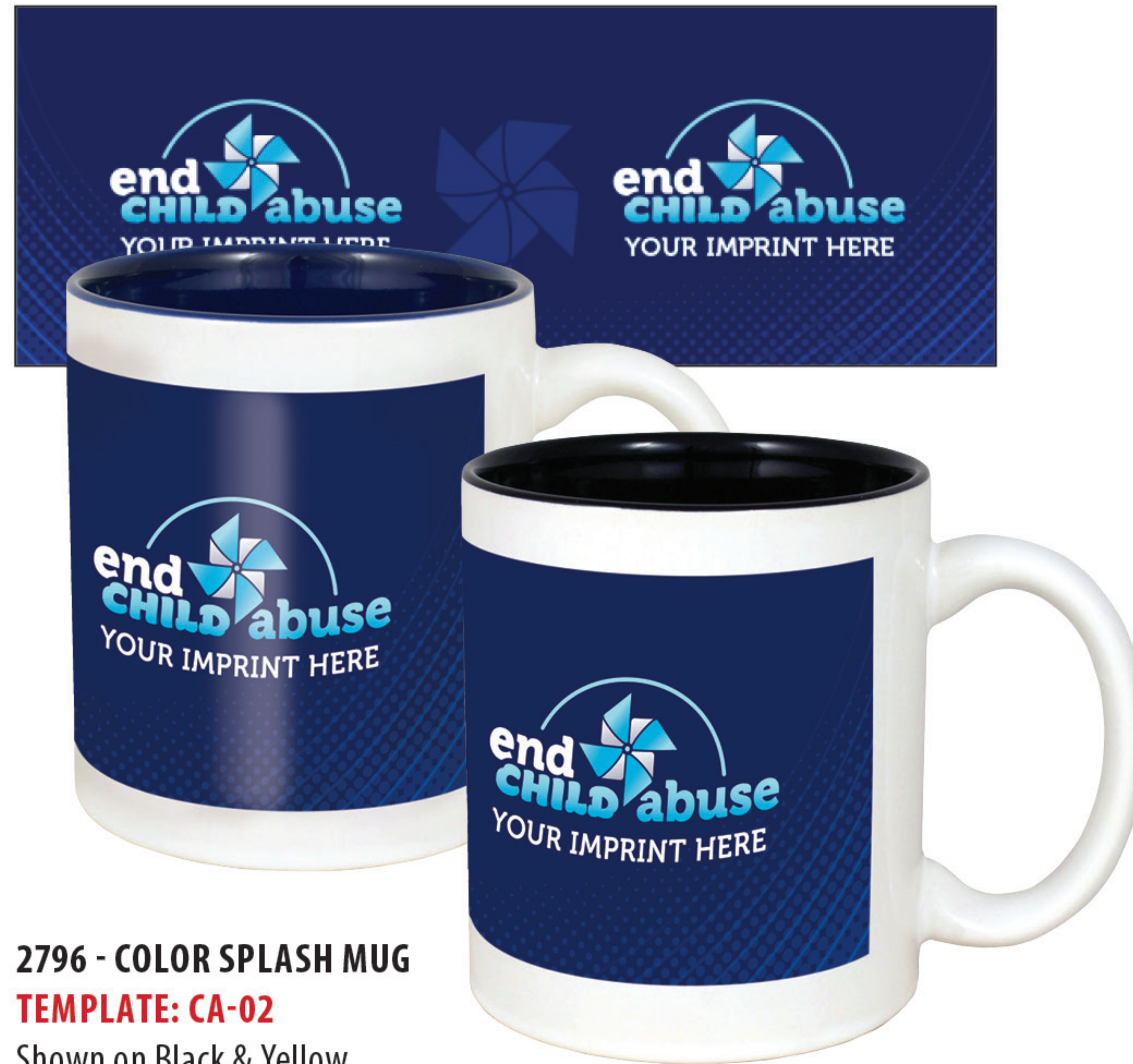
2796 - COLOR SPLASH MUG TEMPLATE: CA-02 Shown on Black & Yellow