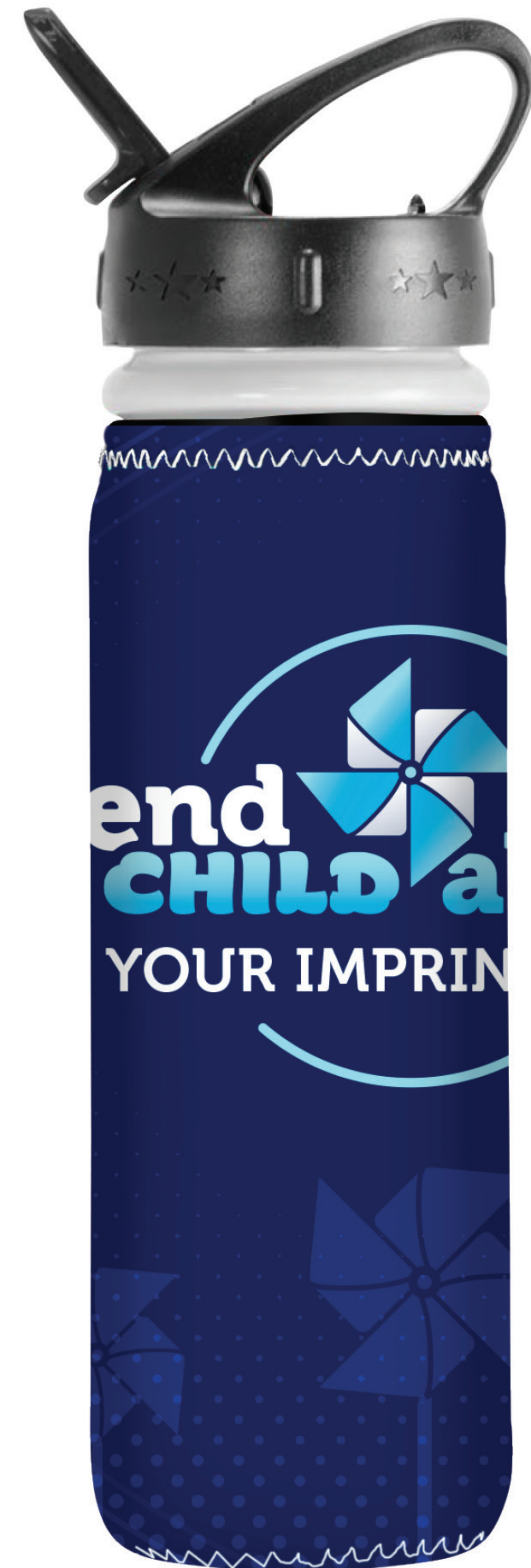
3025 - CAMPAIGN BOTTLE TEMPLATE: CA-04