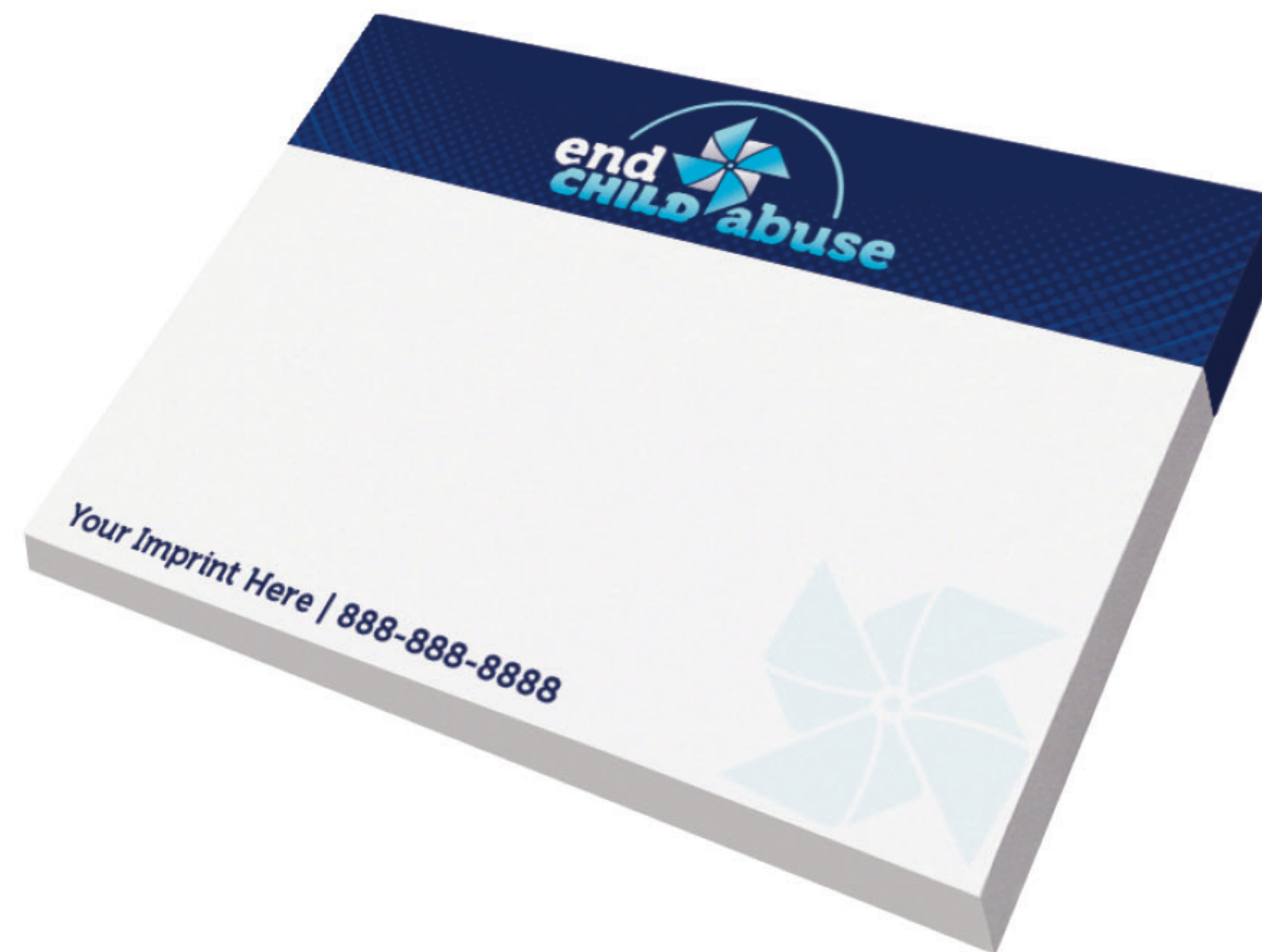
2433B - BIC STICKY NOTEPAD-50 TEMPLATE: CA-02