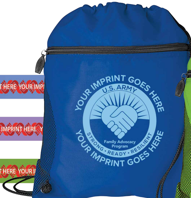
2746 - AWARENESS CINCHPACK