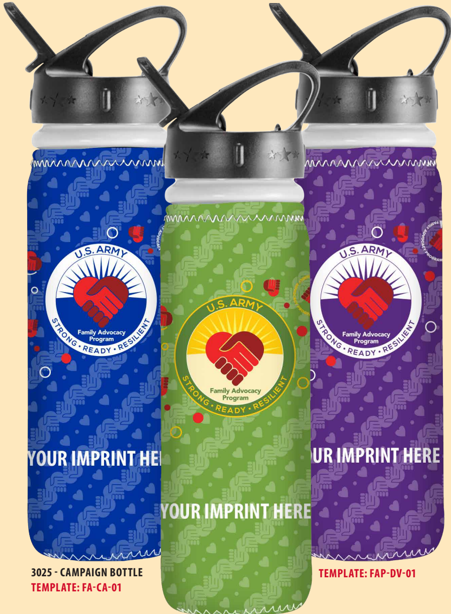
3025 - CAMPAIGN BOTTLE TEMPLATE: FA-CA-01