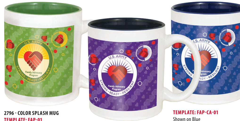
2796 - COLOR SPLASH MUG TEMPLATE: FAP-01 Shown on Green