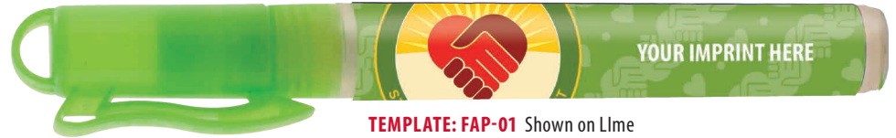
TEMPLATE: FAP-01 Shown on Lime