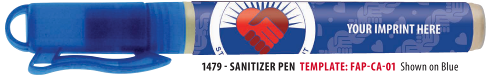
1479 - SANITIZER PEN TEMPLATE: FAP-CA-01 Shown on Blue