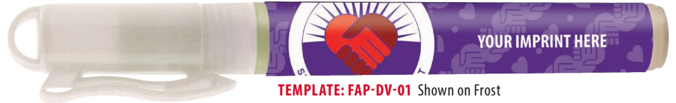
TEMPLATE: FAP-DV-01 Shown on Frost